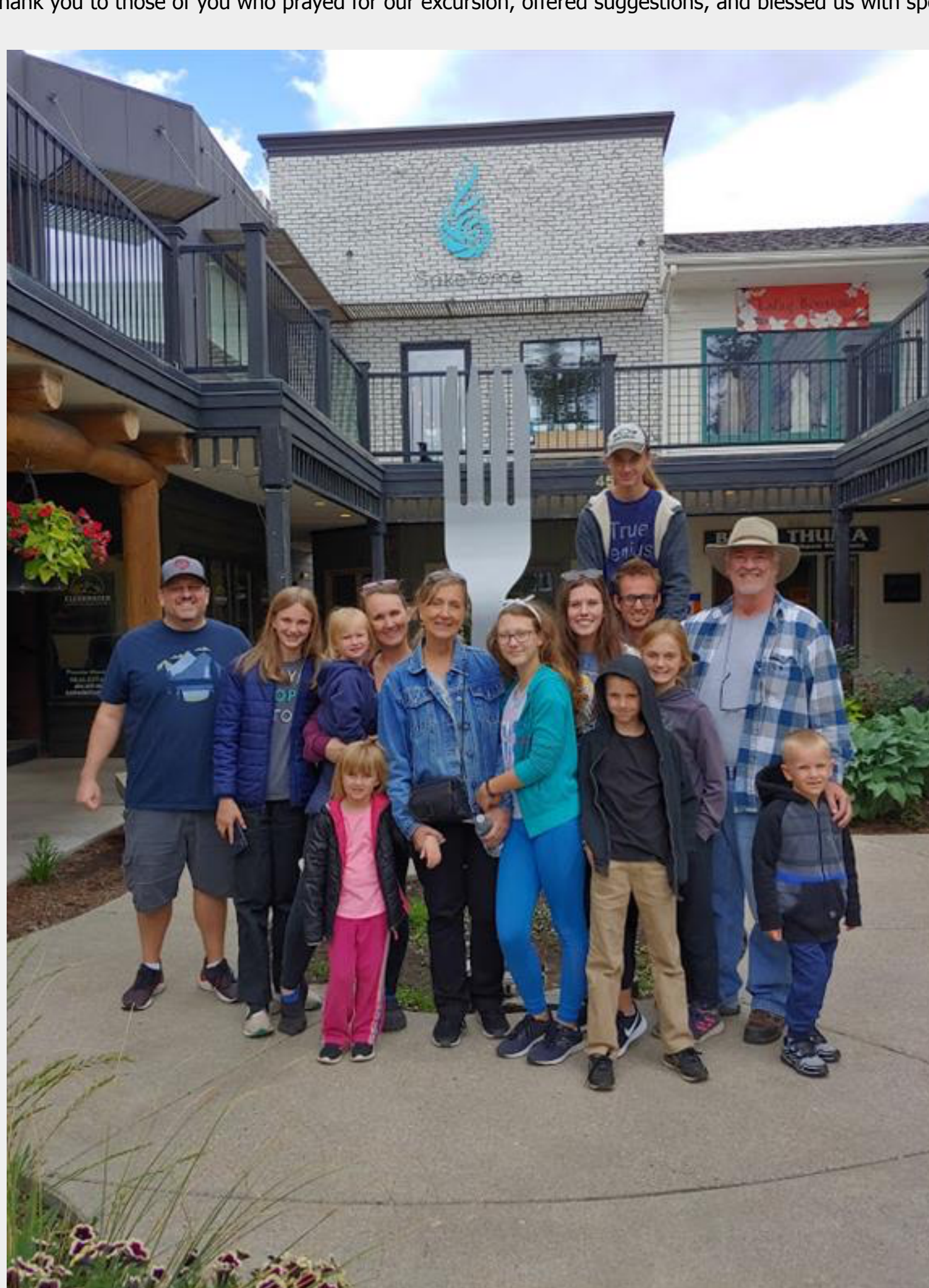
Half the Crew in Big Fork, Montana

Last year we attempted a getaway only to find ourselves traveling from the West Coast to the East Coast as fast as we could to rescue my mom whose health was failing rapidly and brought her to an emergency hospital visit. After a long year of settling her into a new residence close by family in Arizona, and the escalation of COVID in our state, we thought it was a great time to embark on our journey. We began our time with all of our family members (26) meeting in Montana. What a beautiful sight to have all 16 of our grands running free and enjoying the fresh air of Montana. It was a joy to spend a few days with our daughters and son in laws. Each one seemed to have a special contribution to the family get together: helping one another to rein the children in, getting dinners together, finding places to stay, and organizing family games and outings. What a beautiful reprieve! We spent hours on the road after that moving towards Utah and Colorado and finding beautiful places to camp. We met several special families, prayed for the nation with complete strangers who had a heart to see revival, sowed seeds of love, and left Bibles and painted rocks in different places along the way. It was a lovely time indeed. Thank you to those of you who prayed for our excursion, offered suggestions, and blessed us with special foods (cookies and muffins).