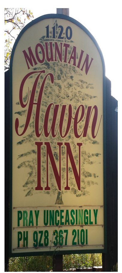
Mountain Haven Inn

life's circumstances but left with courage. Some came with heavy hearts but left with renewed vision. Seasoned saints, brand new babies, weary or encouraged they came and gave testimony of a Savior who delivers, redeems, and heals. None could deny His tangible presence living in each one who attended. Our hearts were knit together; our lives were intertwined; our strength was renewed.