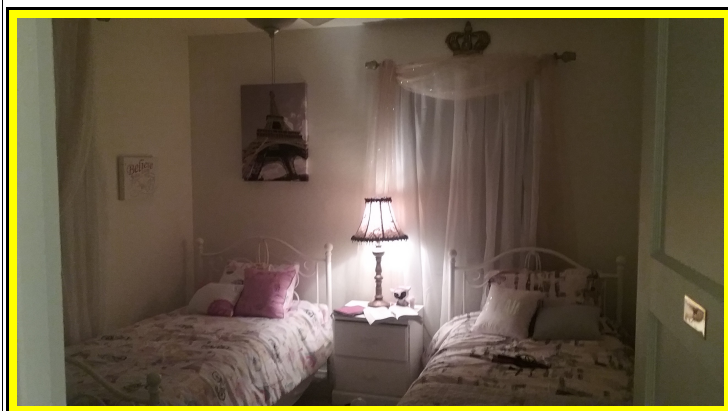
One of the beautifully decorated bedrooms at Hope In Christ.

I would just like to say if God puts something on your heart to do, even if it's far beyond what you think you are able to do, He will be faithful and walk beside you every step of the way. If you had told me one year ago that I would have opened this shelter I would have said, "You're crazy! I don't have the resources for this kind of undertaking." With God all things are possible. If he brings you to it, he will bring you through it!"