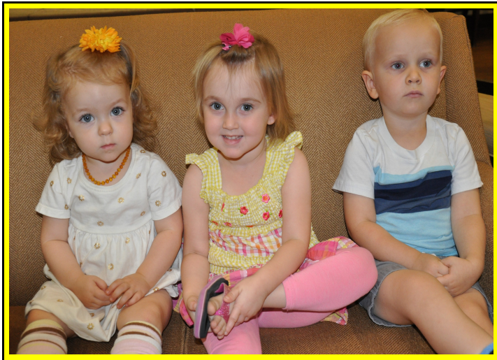
Winning Hearts at Wellspring Therapy Center