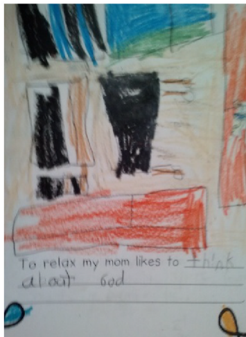
"To relax my mom likes to think about God"

Thank you for your support. You make it possible for us to impact others.