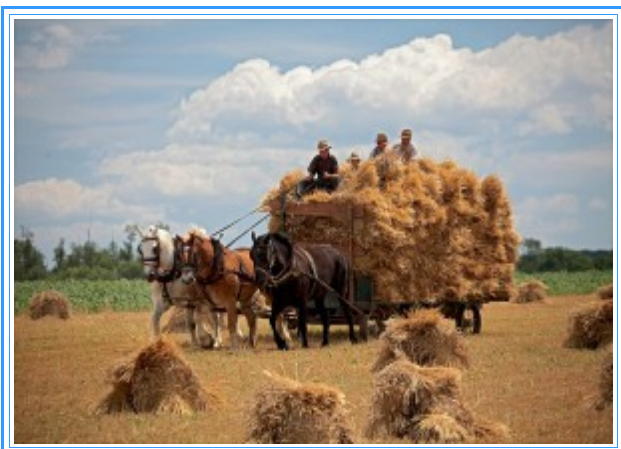
BRINGING IN THE SHEAVES

Our hearts are overjoyed as we see the years of ministry produce a harvest. The difficult times in ministry prepared us for many of the personal challenges we have faced and enriched our lives beyond description. We continue to seek avenues to support other like-minded missions, especially fledgling ministries that have a heart for the truly broken and the "... least of these." Tools and training opportunities were few and far between in those early years of the mission. So few were doing what we were doing, so it necessitated developing our own training manual and training tools. This has fueled our passion to sow into others. We are grateful to the supporters that have made these training opportunities and materials a possibility!