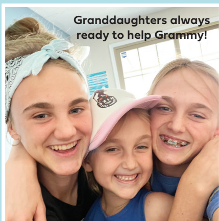
Granddaughters always ready to help Grammy!