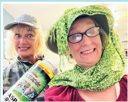
Six nasty hornet nests had to be annihilated. My sister and I scared them off! (Along with a little hornet spray!)

Sometimes He uses His many membered body. I have been completely blessed by so many saints, visiting, cleaning, bringing meals, repairing things at the home, and doing much more than I could ever ask or think! Take a glimpse at just a few of the able bodies God has sent to bless me.